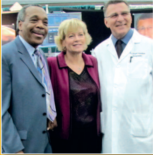
▲ Senator Boscola meets with small business owners at the Greater Pocono Chamber of Commerce Expo.