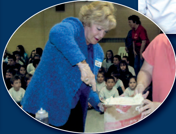
▲ Senator Boscola helps students at St. Anne School set a new Guinness World Record for the longest ice cream sundae. The new record was set at 150 feet long, which beat the old record by nearly 20 feet.