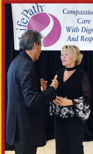
Attending the annual Lifepath/PICPA Thanksgiving benefit & awards event this past fall.