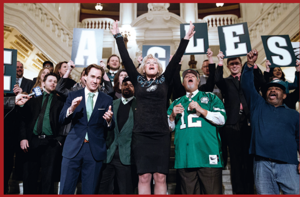
Representing Lehigh Valley fans of the Philadelphia Eagles prior to their historic Super Bowl LII championship.