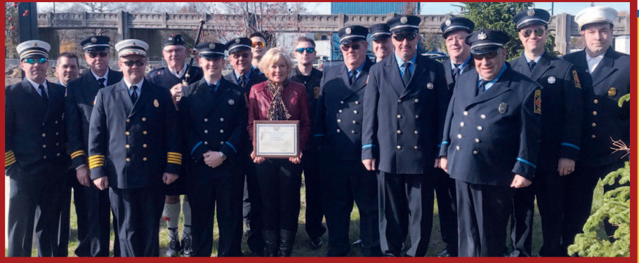
Dedicating the Firefighters Memorial and Walk of Honor with personnel of the Catasauqua Fire Department.