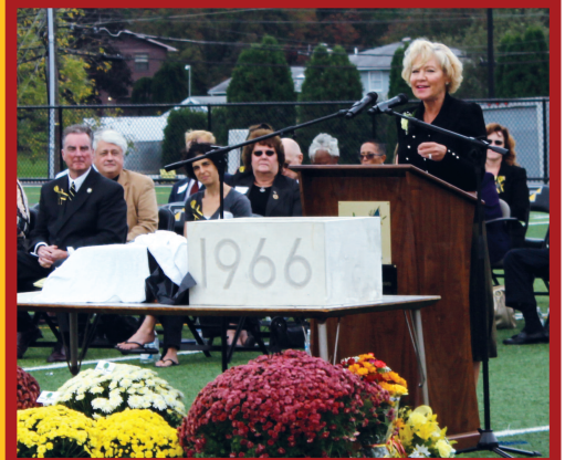
As a proud alumna, it was an honor giving the keynote address at the 50th anniversary of Freedom High School.