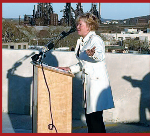
Speaking at the opening of the New Street Parking Deck.