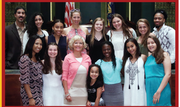
Congratulating the students & coaches of Bethlehem Catholic High School's Lady Golden Hawks basketball team on winning their first state title in school history.