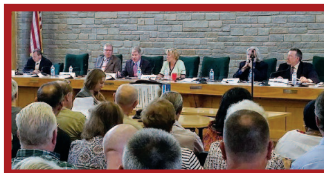
Holding a hearing on property tax reform in Bethlehem Township.

So, I was thrilled to see local voters overwhelmingly support a referendum that will enable local governments to double the property tax homestead exemption. The approval of this referendum means legislators can take a different approach to providing meaningful relief to homeowners. With the