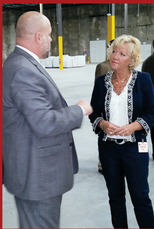
Visiting the grand opening of the state-of-the-art Iron Mountain Inc. records management facility building in Easton.