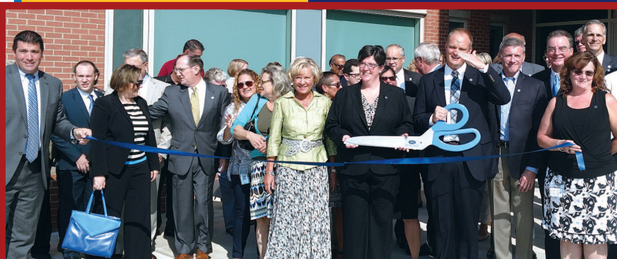
Cutting the ribbon with the students, faculty, family and friends at the new Nitschmann Middle School in Bethlehem Area School District.