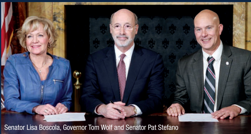
Senator Lisa Boscola, Governor Tom Wolf and Senator Pat Stefano