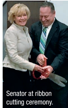
Senator at ribbon cutting ceremony.

Equally important, the land which FedEx purchased for the Hub was owned by the Lehigh Valley Airport Authority. This transaction helped place the Airport on sound financial footing which is important for our local economy and for the growth of our region. ■