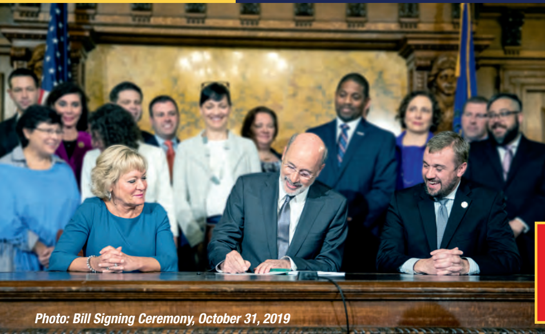
Photo: Bill Signing Ceremony, October 31, 2019

Call or stop by any of my offices for assistance today with your mail-in ballot application.